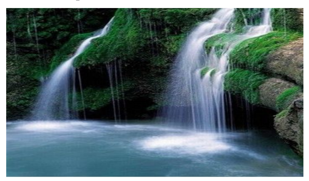
2012 年环球旅游指南: 去哪里最划算

Costa Rica has to offer. According to Travelzoo, airlines are increasing the number of flights to Costa Rica, which could signal more competition and more deals for consumers.